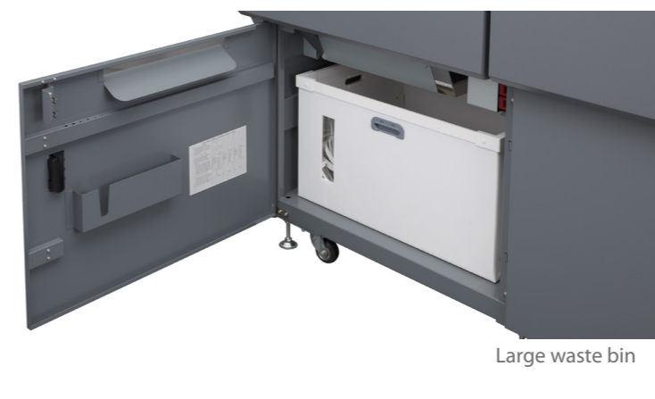
Large waste bin