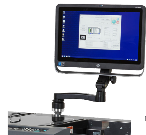
PC Controller software