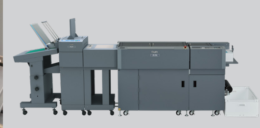
DC-746 with Integrated Folding System